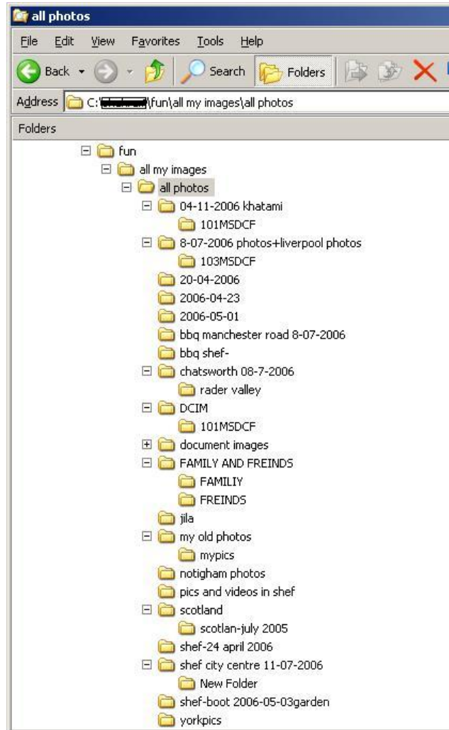
Figure 2: Typical Folder Organisational scheme showing heterogeneous folder names

were uploaded at the same time). This made identification of the correct folder and picture hard.